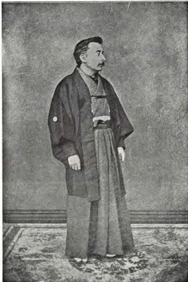
Lafcadio Hearn in Japan.

in dealing with publishers, he was basically a very shy person—not a particularly commendable trait for a newspaper contributor. Another problem which upset him was his appearance. As a young lad, he had lost the sight in his left eye, which took on a shrunken look, while his right eye became much enlarged. Most of his pictures show a profile view, so that this incongruous aspect of his features is not obvious.