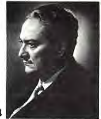
MANLY P. HALL

Now Available In Its Original Size and Folio format