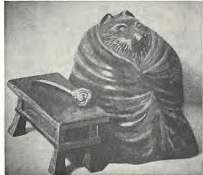
The badger disguised as a monk, from a Japanese wood carving.

It might seem that life in a world of gnomes and elves, and malicious sprites would be extremely difficult, but such does not seem to have been the case. The little people were taken for granted, and for the most part played a constructive part in human affairs. They encouraged close family life and fortified the spiritual resolutions of