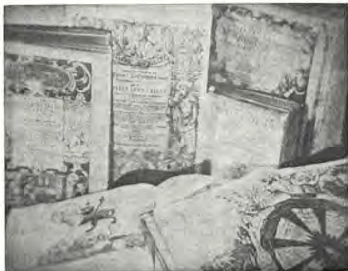
Rare books and manuscripts on alchemy.