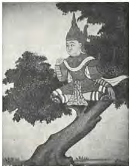
TREE SPIRIT. From the book The Thirty-Seven Nats by Sir R. C. Temple.

seven Nats , a magnificent volume by Sir. R. C. Temple, Bart., C.I.E., published in London in 1906. The Nats are protecting spirits, and according to Temple their duties included the guarding of mighty rivers and lesser streams, lakes, torrents, cataracts and whirlpools; the protection of vast forests and single trees, and the preservation of the sacred relics of the Buddha. The Burmese elves are now seldom pictured in their earlier forms, but are dressed in Hindu and Buddhist vestments. They also have derived much of their symbolism from the complex Indo-Chinese Shan culture, and are often costumed like the Buddhist images of Thailand. Another example is the spirit house which Thai Buddhists place close to their homes for the convenience of resident, or visiting spirits. Many of these little houses are beautiful structures resembling miniature temples, and the spirits who dwell in them perform the same functions as the Lares and Penates of the early Latins.