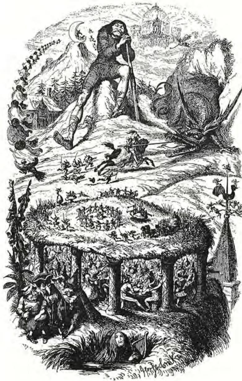
Frontispiece from Fairy Mythology by Thomas Keightley. Illustration by George Cruikshank.

great intelligent cause of all, however he may designate it; the other, when unusual phenomena excite his attention, ascribes their production to the immediate agency of some of the inferior beings recognized by his legendary creed."