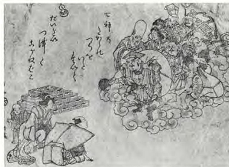
The seven fortunate deities appearing to a worthy couple.

Shintoism which still includes nearly half the population of Japan in its membership, gained considerable moral support from old Chinese lore. Most of Asia believed in a living universe. Every creature was alive, and what we term evolution, was the sequential revelation of the spiritual potential resident even in a grain of sand. While Shintoism includes the special veneration of persons,