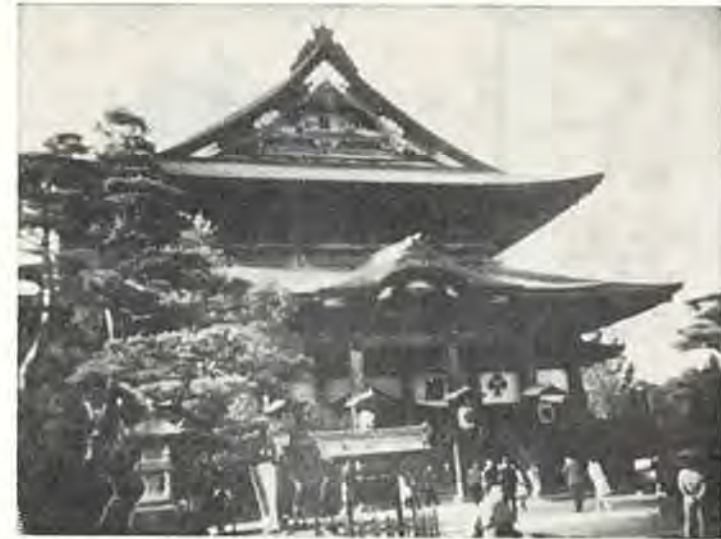
The Zenkoji Temple at Nagano.