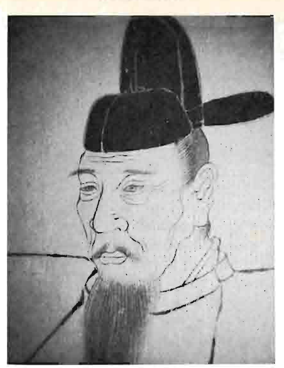
Hideyoshi, from an original sketch by Gessen.

determined to find only that which is of the highest ethical and moral integrity. Every symbol must be interpreted according to its best possible meaning.