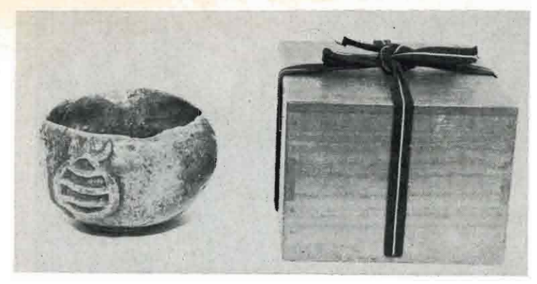
Special tea bowl used in the annual festival honoring the spirits of the dead.

This may be one of the most difficult of the tea virtues to cultivate. It is hard to prevent selfish thoughts from coming into the mind. It requires many years of insight, and perhaps long periods of Zen discipline and meditation to disentangle the mental-emotional nature from involvements in attitudes that are not pure or beautiful. Here again the tea vessels themselves teach a silent lesson. Every part of the ritual is performed with absolute cleanliness. The bowl and the little tea jar may look rather decrepit, weather beaten and dingy, but they are spotlessly clean. Age is not a detriment unless it is mutilated by neglect. All things must be brought