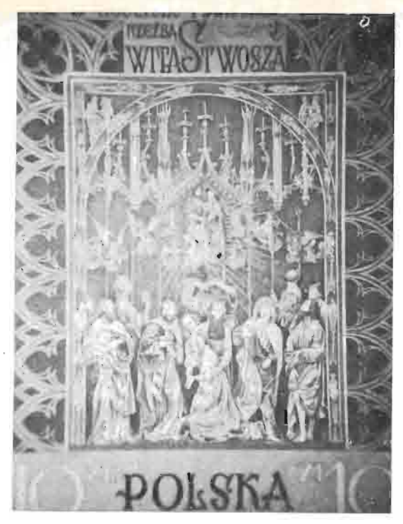
Miniature sheet issued by Poland in 1960, showing carvings in St. Mary's Church, Cracow.

In the period between 1840 and 1900, very few stamps actually celebrated or commemorated the Christian faith. In 1895 Portugal commemorated St. Francis of Assisi, with a well designed set of