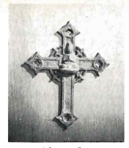
A JAPANESE CROSS

The cross is of iron and quite rusty. From the reverse it would seem that the iron was poured into a shallow mould and there has been little or no finishing of the surface. It is difficult to say whether the appearance of antiquing is genuine or the result of artificial aging. Even if it is not of great age, it could have been exposed to inclemencies which would quickly give it an appropriate patina. Although the elements of the composition give the appearance of heing old, the subject itself and the treatment would probably indicate that it could not be much earlier than Meiji (late 19th Century). Prior to this time such an object might have led to disgrace or persecution for its owner. The small Buddha in the center is in the style of the 12th-14th Century and may be a genuine antique or a reasonably faithful reproduction.