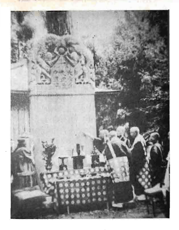
1911 DEDICATION CEREMONY Photograph of the ritual at Mt. Koya honoring the Nestorian Monument.

With the decline of Nestorian Christianity and the increasing prejudice against foreigners, especially missionaries, the vestiges of early Christian activity in China were lost to view. For centuries the Nestorian monument remained hidden in the good earth of China. It is agreed that the great stone was rescued from oblivion