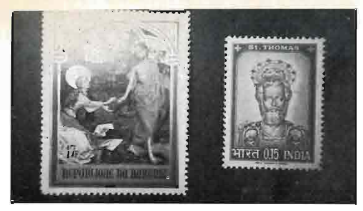
Left—Stamp by Burundi (Africa). Christ in the Garden after Resurrection.

There was a gradual increase in the use of a religion theme from 1901 to 1940. By this time most Christian nations had reproduced at least one important work of Christian art, usually from national collections or from the archives of the Church. The patron saints of countries appeared on postal paper, and artistically speaking the results were most gratifying. During the period of World War II, stamps with sacred themes faded out of the picture, especially in countries dominated by the Rome-Berlin Axis. After the war the countries behind the Iron Curtain devoted their stamps largely to portraits of Marx, Lenin and Engels, and designs glorifying the