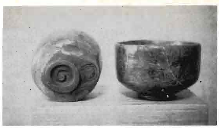
TWO OLD TEA BOWLS

The one at left shows a Raku seal. The one at right has a faint design of pine needles and has been skillfully mended with gold lacquer.