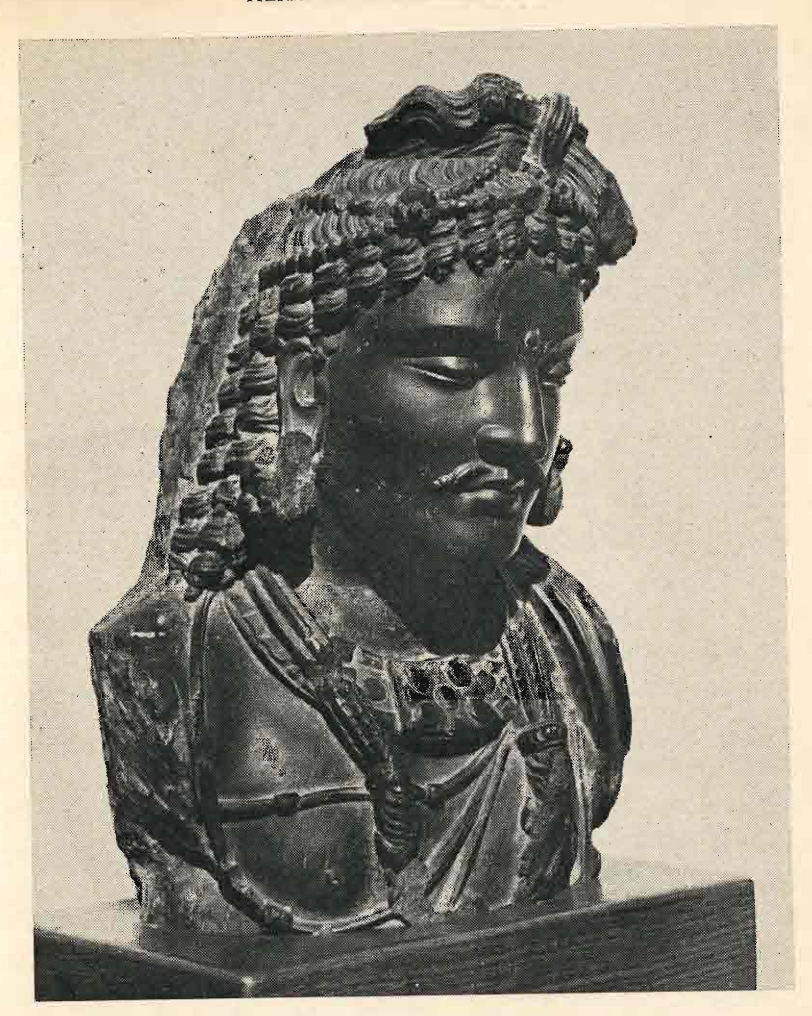
HEAD OF A BODHISATTVA

The artisans of Gandhara were influenced by the Mahayana School of Buddhism, but were also tied closely to the earlier Indian Sects. Both the Buddha image and the bodhisattva type seem to have developed in the Gandhara area. Originally, there was only one bodhisattva, and that was Prince Siddhartha before his attainment of buddhahood. As the son of a ruling monarch and heir to the throne, it would be appropriate to represent him as a young man of noble appearance, dressed in the courtly costume of his time. No contemporary likenesses are known to have survived, but the artists of Gandhara, working nearly eight centuries after the death of Buddha, depicted his appearance in three ways.