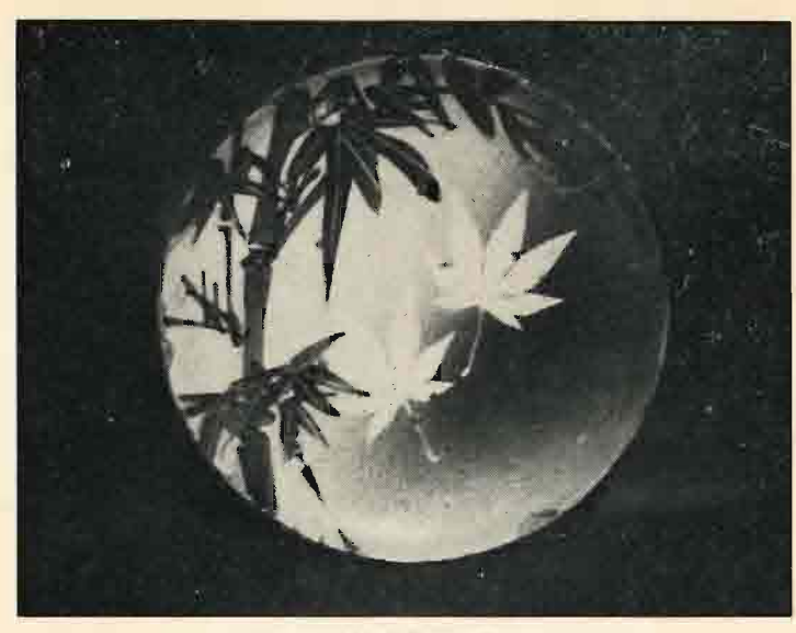
STENCILLED SETO BOWL

The background of maple leaves is stencilled and the blown pigment results in a dark area, throwing the leaves into contrast. The bamboo is in the form of hand decoration. Both designs are in blue.