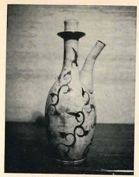
HEAVY STONE WARE EWER

Seto ware has been included in a number of museum catalogues, and occasionally a good example is given as an illustration. In the predictable future, this unusual pottery will be worthy of a distinguished place in public collections. Recently I noticed two Seto plates in the world-famous Brundage Collection in the DeYoung Museum in San Francisco.