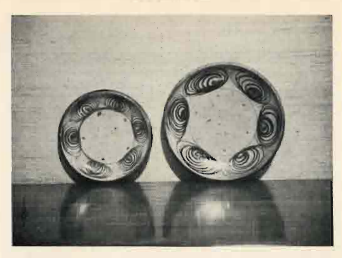
SETO PLATES WITH HORSE-EYE DESIGN

This pattern, which is much admired in Japan, belongs to the middle period of Common Seto, about the year 1800. The small plate is 8-1/4" in diameter and the larger is 10-1/4". The firing spurs are especially noticeable on the inside of the small plate. The color of both plates is iron-black.