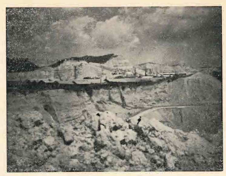
THE QUARRIES OF SETO

From these hills was obtained the clay used in the manufacture of Seto ware. Also visible in the photograph are the low, long roofs of modern pottery factories.