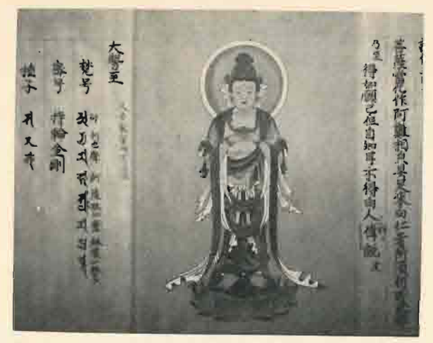
DETAIL FROM A SHINGON SCROLL

ments were served by the Hospitality Committee after the morning lecture. At two o'clock Mr. Hall gave an illustrated talk on "The Arts of Esoteric Buddhism," showing an unusual group of 35mm, slides. These featured material in the P.R.S. Collection, National Treasures of Japan, and priceless antiques preserved in temple museums. A number of slides were devoted to manuscripts of Esoteric Buddhism, which describe and picture the elaborate icons based upon early Hindu, Tibetan, and Chinese records. The scrolls were written over two hundred years ago, and the figures were beautifully drawn by skilled artists. A detail from one of these Shingon rolls is shown herewith.