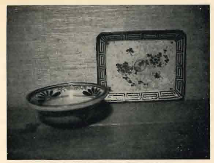
OTHER TYPES OF SETO STONE WARE

The glaze is somewhat influenced by the color of the decoration. Generally, however, it is a greyish-beige and often shows some crazing. This is a coarse crackle, and the grey tone is most noticeable in the areas where the crazing is prominent. The crackle may