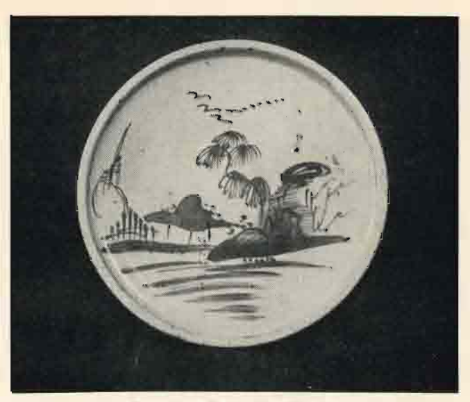
COMMON SETO OIL PLATE

I have not been able to learn whether any modern writer has described types of Common Seto pottery other than those in the form of plates for food or oil. The few who have researched this subject have been content to concentrate entirely on the plates. Recently I secured in Japan several other items, which dealers with considerable skill and good reputations solemnly insist are Common Seto ware. One is a tall ewer-type vessel, decorated with conventional tendrils in cobalt blue. Another is a most unusual rectangular shallow platter, in dark brown decoration and the familiar Seto glaze. I was also fortunate in securing a deep dish