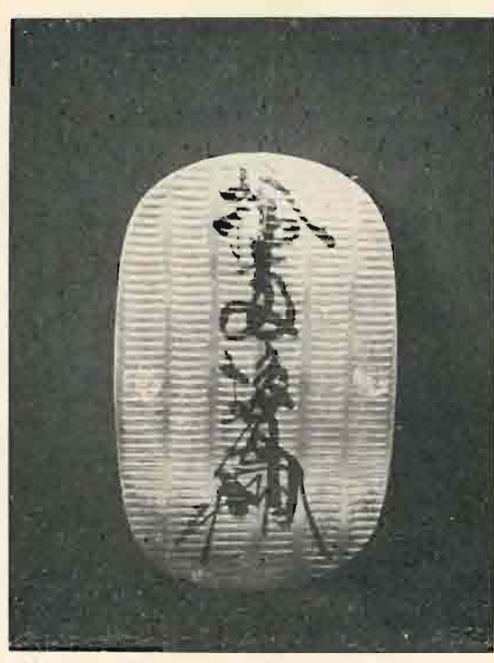
JAPANESE KOBAN WITH PAINTED INSCRIPTION

worth of silver was regarded as a financial reward for this painstaking operation. For many years, all silver coins in Chinese banks were stamped with purple ink as a guarantee that they were in their original condition.