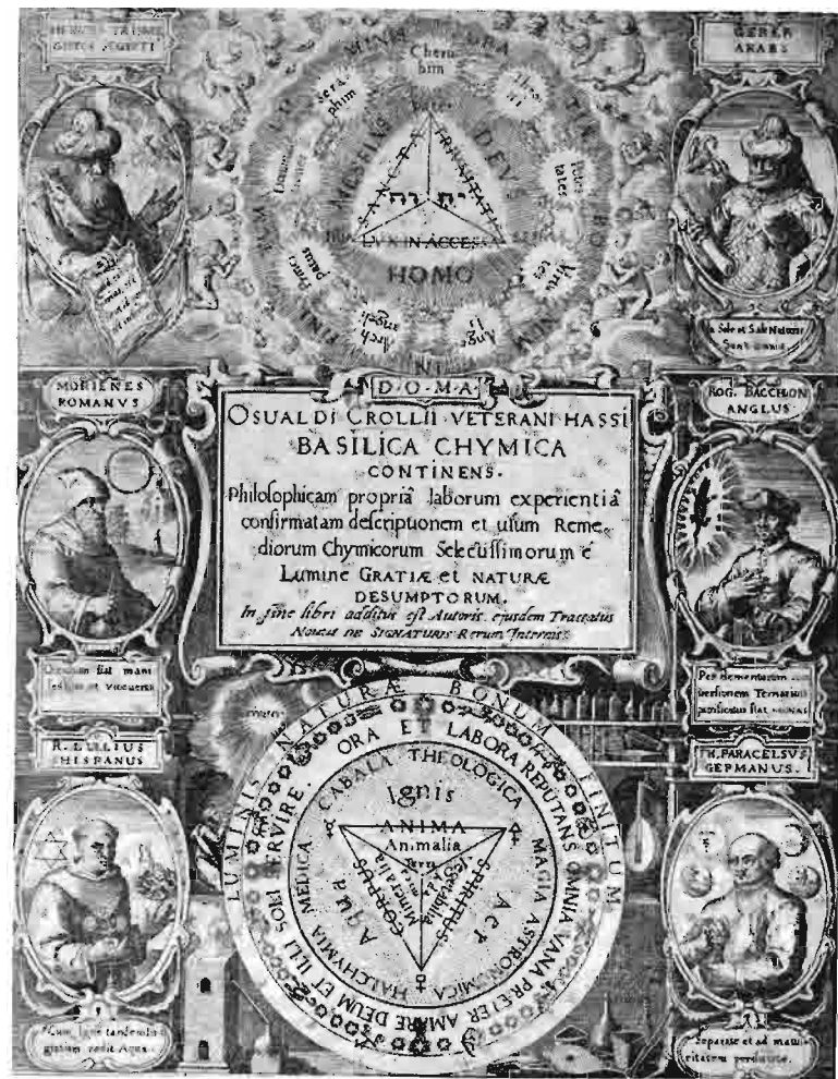
Title page of Basilica Chymica by Oswaldus Crollius, amanuensis to Paracelsus. At lower right of plate is portrait of Paracelsus.

nearly so complicated. While there may always be need for scientific guidance, such need will be the exception rather than the rule. By the integration of his life around constructive and natural procedures, the average person will enjoy a greater measure of good health than he at present regards as possible.