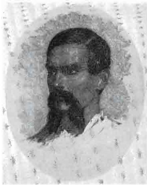
Sir Richard Burton