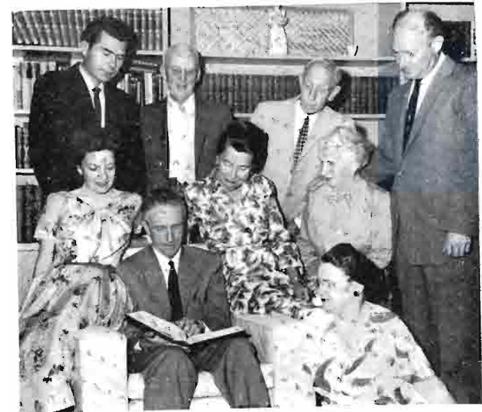
THE WEST LOS ANGELES STUDY GROUP

2. If we take the attitude that the atomic peril is no cause for hysteria, what is the element that saves this point of view from being equivalent to an attitude of indifference toward life?