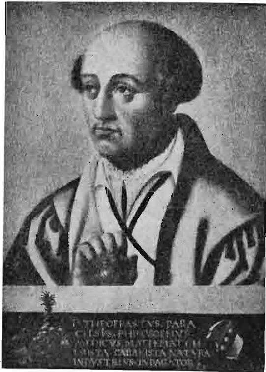
From Stoddart's Paracelsus