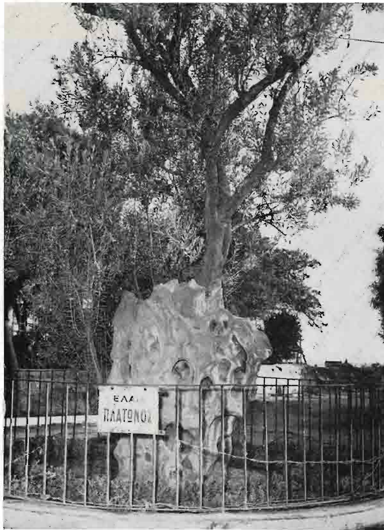
PLATO'S OLIVE TREE

Through the kindness of a friend who attended the recent Pythagorean festival in Greece, we are able to reproduce herewith a photograph of the Olive Tree under which Plato taught his disciples more than 23 centuries ago in Athens. It is interesting and significant that from the ancient trunk a live tree is growing, which may well symbolize that the teachings of this great philosopher live in the modern world as a constant source of enlightenment and inspiration.