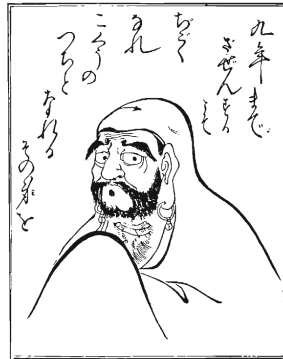
BODHIDHARMA, 28TH PATRIARCH OF ZEN

127 pp., - Bound in Boards - Price $2.00