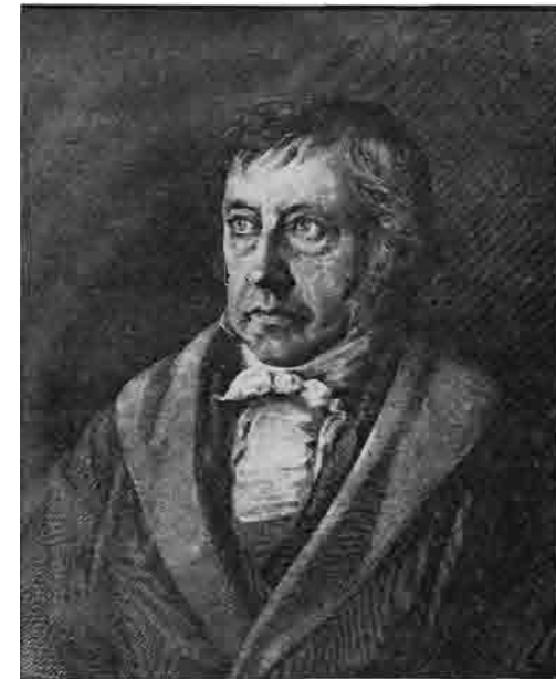
GEORG WILHELM FRIEDRICH HEGEL

In spite of Hegel's personal peculiarities, or perhaps because of them, his philosophy, known as Hegelianism , exercised a powerful influence upon the German mind of the 19th century. Hegel's attitudes on religion are typical of his involved mental processes. There is a legend that he once remarked: "Only one person in the world understands me, and he does not." Hegel's respect for the life and teachings of Jesus was profound, and throughout his life this German philosopher was deeply concerned with the spiritual mystery at the source of life. Broadly speaking, he attempted to reconcile the ontolog-