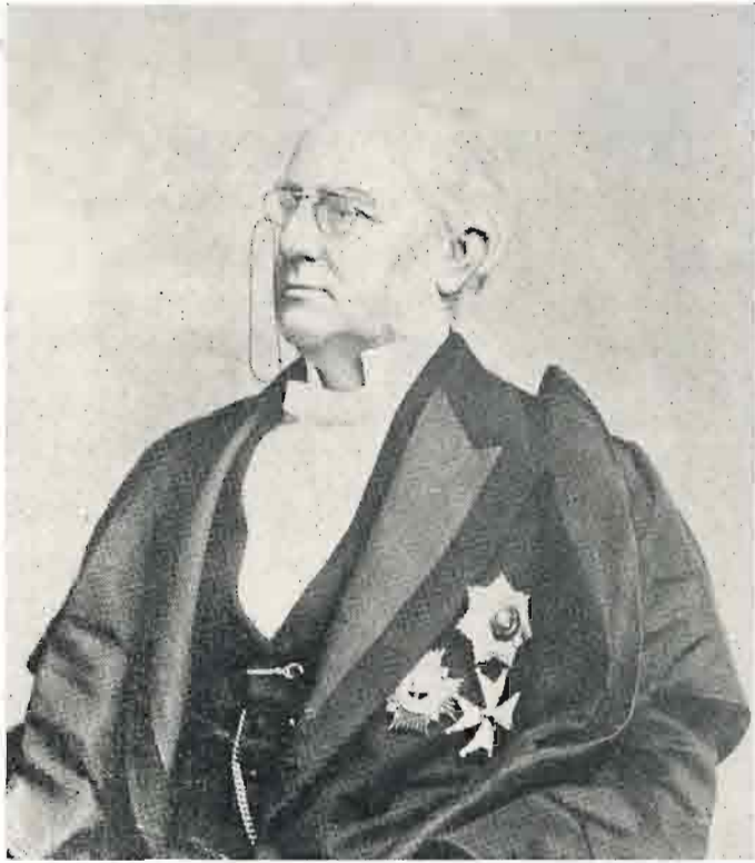
FRIEDRICH MAXIMILIAN MUELLER

Photograph taken on the occasion of his 50th anniversary as Doctor in the University of Leipzig.