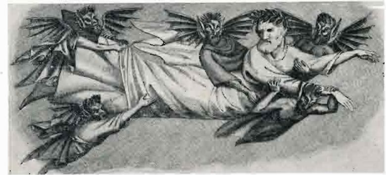
SIMON MAGUS SUPPORTED IN THE AIR BY DEMONS

The most fantastic of the many legends concerning Simon is contained in the apocryphal "Acts of the Holy Apostles Peter and Paul." The origin of this work is uncertain. Some parts are considered to be early, others are most certainly comparatively late. A translation of a portion of this apocryphal book appeared in 1490, and Dr. Tischendorf examined six manuscripts, the oldest of which dated from the 9th century. We may therefore have certain reservations concerning the authenticity of this account, not only because it was probably compiled after the legend of Simon had passed through numerous cycles