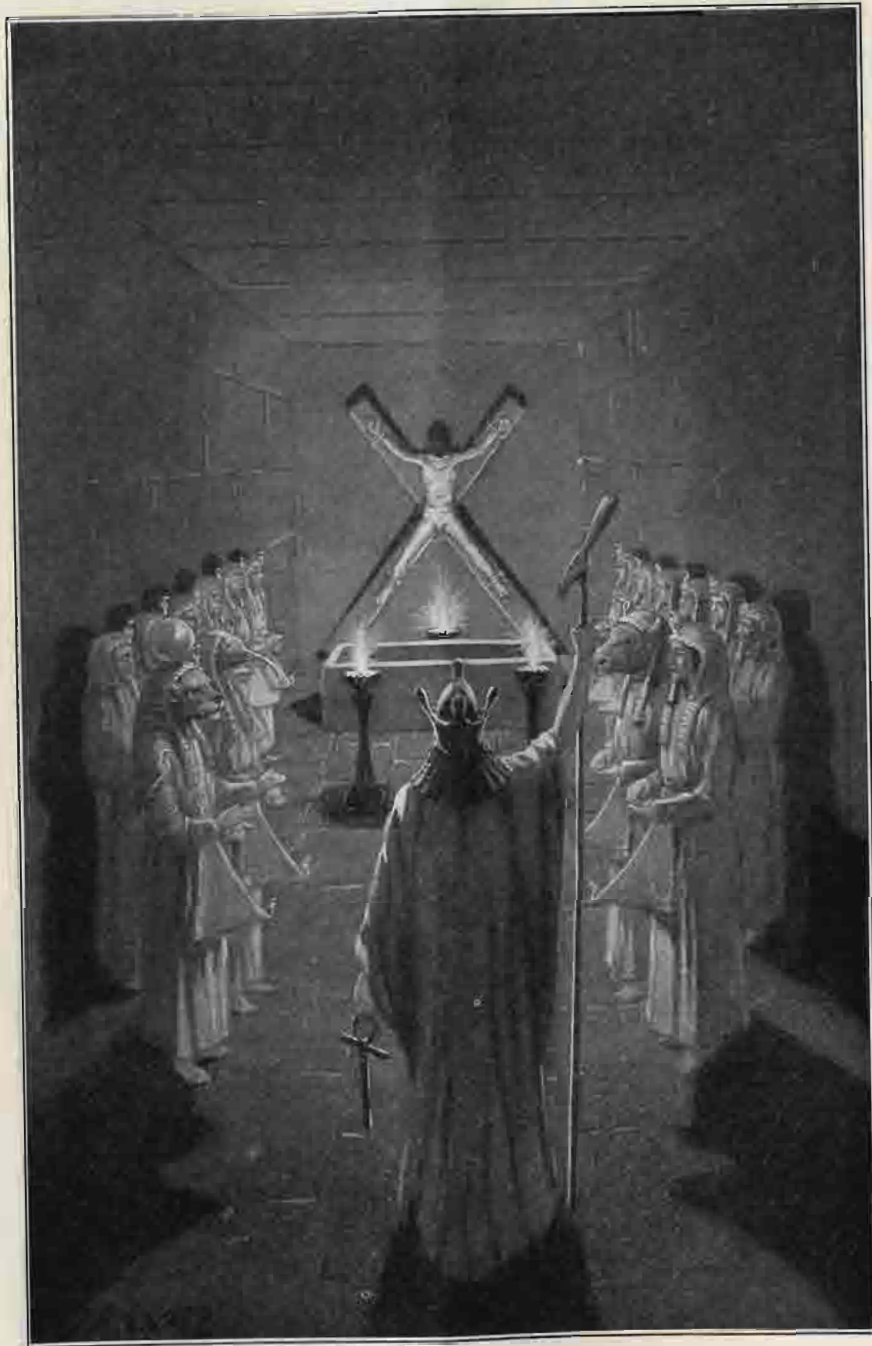
The Initiation in the King's Chamber

ments man may read, as in a book, that secret doctrine which the first civilizations of antiquity bequeathed to their heirs, successors, and assigns.