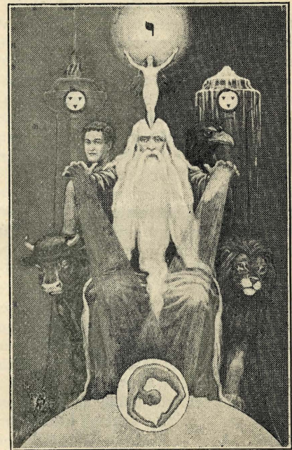
Jehovah, the Creative Diety.

One of the full page color prints in the Encyclopedic Outline of Masonic, Hermetic, and Rosicrucian Symbolical Philosophy; to which is added a Treatise on the Qabbalah of the Jews. Being an Interpretation of the Secret Teachings Concealed within the Rituals, Allegories, and Mysteries of All Ages. The Entire Work Amplified with Numerous Quotations from Ancient, Medieval, and Modern Authorities, many from Unpublished Manuscripts and Books Long out of Print, Gathered by the Author,—Manly P. Hall.