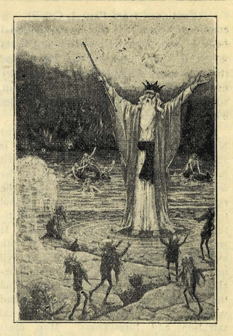
Conjuring the Children of the Elements —Gnomes, Undines, Salamanders, Sylphs.

gles laid around the base square. The four-sided base of the pyramid represents the four primary elements of which man's bodies are composed. These are hydrogen, nitrogen, oxygen, and carbon, or earth, water, fire, and air. These are called the base of all things and upon this base the four bodies of man are raised, each from its own element. Thus, the physical body (Continued on Page 7, Col. 2)